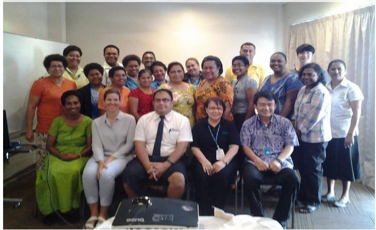
Group photo taken at Day 1 Nutrition in Emergencies Training.