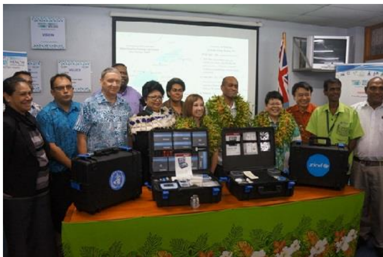
Staff of the Ministry of Health and Medical Services, WHO and UNICEF with newly donated Potalab and Potatest water testing kits, 16 September 2016

The World Health Organization (WHO) and the United Nations Children's Fund (UNICEF), as part of their support of the MoHMS effort of improving water quality monitoring in Fiji have donated to the MoHMS four portable water testing laboratories (Potalab) and seven kits (Potatest) during a 'Handover of Equipment' ceremony at the MoHMS Dinem House on 16 September. WHO and UNICEF also provided the MoHMS with technical guidance on the development of Fiji's water quality surveillance system. These contributions are aimed at meeting international microbiological and chemical standards of water safety and quality and to assist MoHMS at implementing Fiji's National Drinking Water Quality Standards. The equipment will assist the MoHMS's Environmental Health Unit to monitor water quality in rural and urban areas. Both the Potalab and the Potatest systems will be distributed to Divisional Environmental Health Offices and selected sub-divisional offices. The test kits will ensure improved sensitivity, accuracy, and reliability of routine water quality surveillance as well as rapid testing of water supplies in times of an emergency.