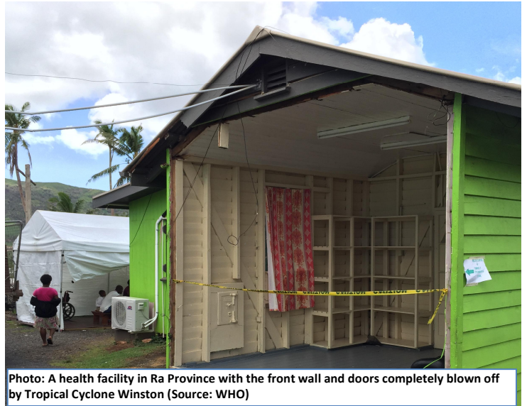
Photo: A health facility in Ra Province with the front wall and doors completely blown off by Tropical Cyclone Winston (Source: WHO)