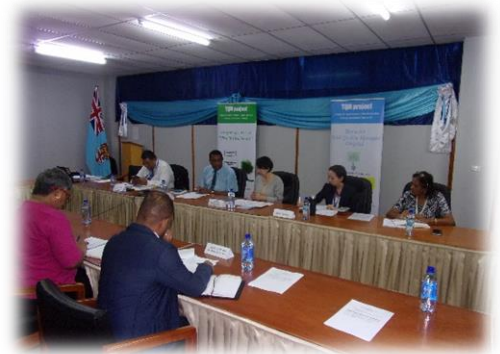
2 nd JCC Meeting October 18 th 2022

Finally, the Representative of Fiji Office was honored to be part of the 2 nd JCC Meeting, implementation of 5S-KAIZEN-TQM in Fiji and has noted that a lot of activities have transpired since the commencement of the project in April 2019, the strong commitment by MoHMS and health facilities would be very important since Fiji is the first country to introduce 5S-KAIZEN-TQM approach with JICA in the Pacific, in order to take a strong leadership on this approach in the region.