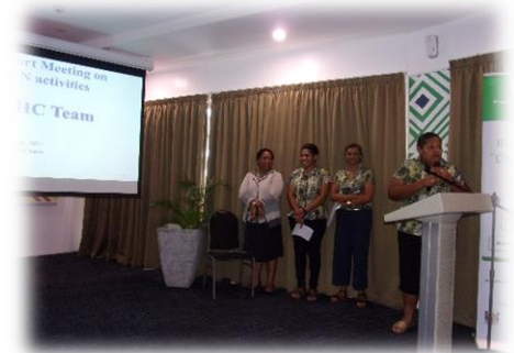
Presentation from Nausori Maternity Hospital/Health Center