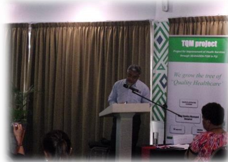
Opening remark from Permanent Secretary

Acting National Manager, Clinical Governance has mentioned during the closing remark that this progress meeting would be helpful to see the progress of 5S-KAIZEN-TQM and which areas of this approach to be promoted. He thanked all of the pilot health facilities for the progress, and insisted the importance of conducting the 5S-KAIZEN-TQM